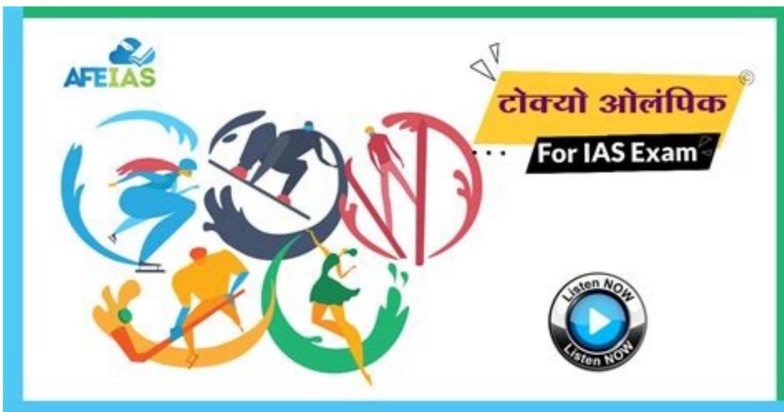
Afeias daily audio english. Afeias daily audio news.